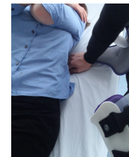
Push into bed firmly