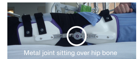
Metal joint sitting over hip bone